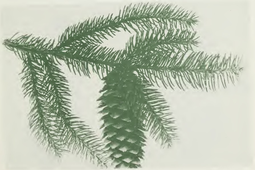
Norway spruce. (About two-thirds natural size)